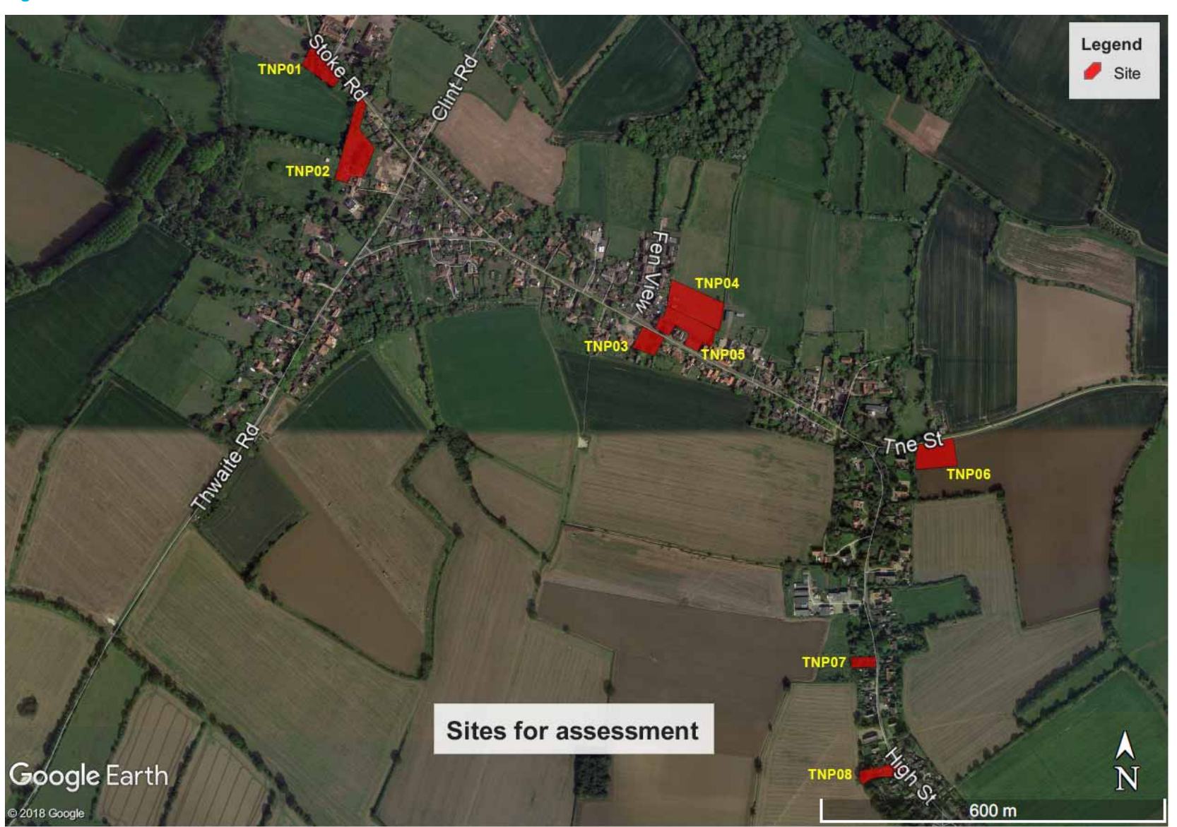
Figure 4 – Sites taken forward for assessment