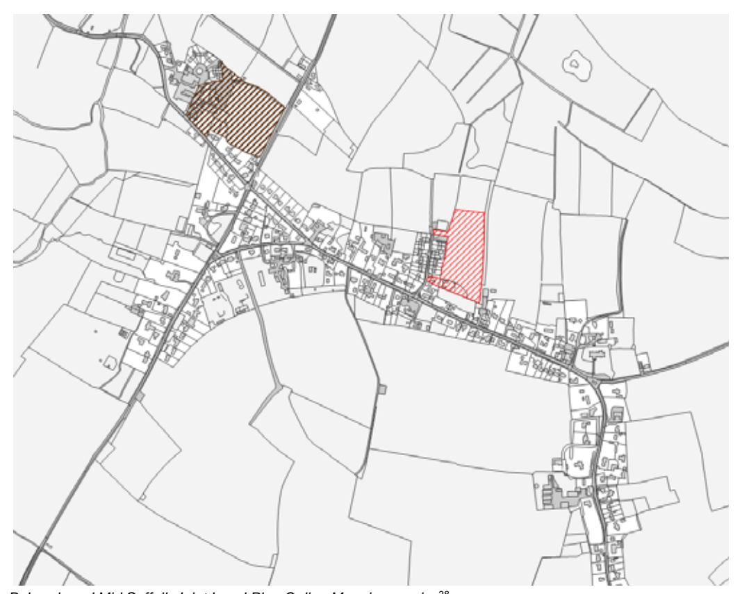
Figure 3 - SHELAA sites identified in Thorndon (red indicates potential residential sites; brown indicates unsuitable sites.