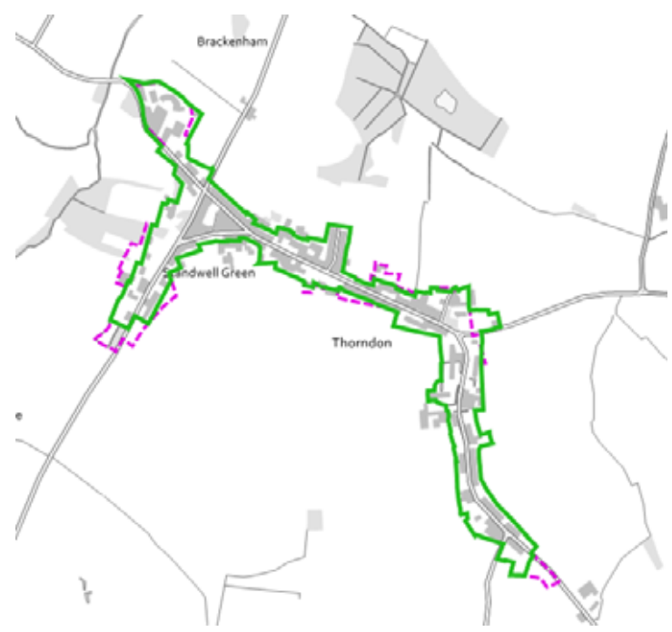
Figure 2 – Existing (green line) and Proposed (dotted magenta line) Settlement Boundary of Thorndon