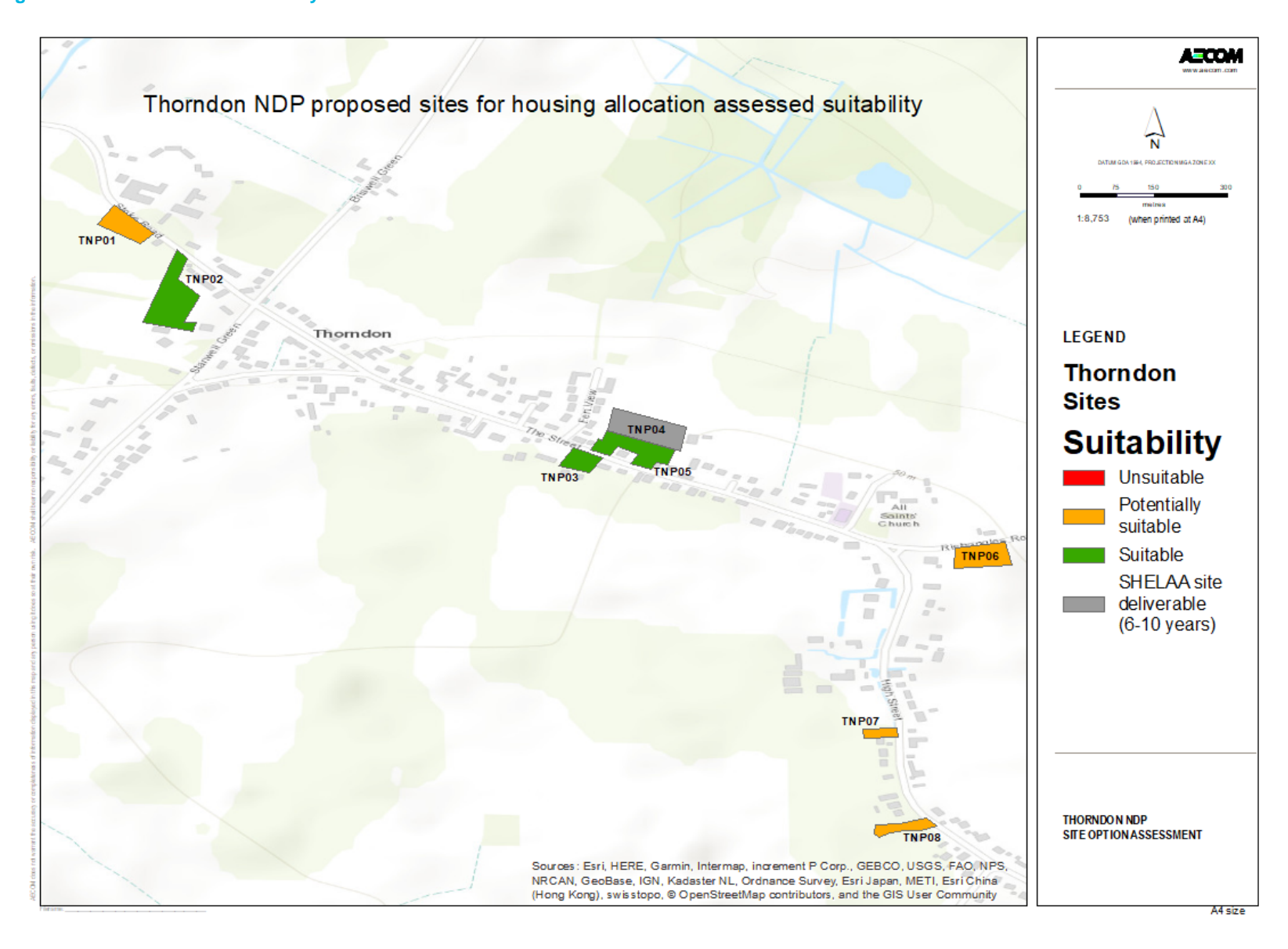
Figure 5 – Assessed sites suitability